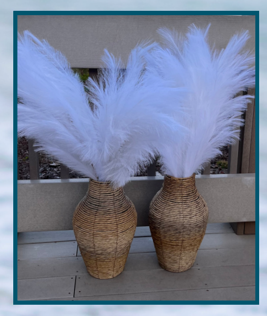
TALL BRAIDED VASE WITH NATURAL PAMPAS GRASS - 2 FOR $150

TALL BRAIDED VASE WITH WHITE PAMPAS GRASS - 2 FOR $150