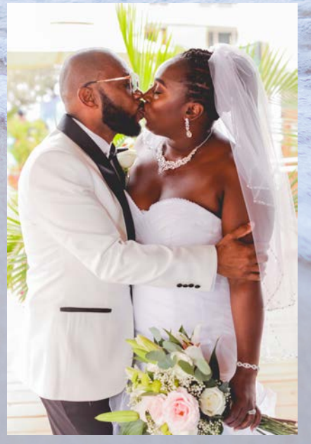
Already have your reception venue Reserved? Kick off your wedding festivities with a rehearsal cruise the night before!