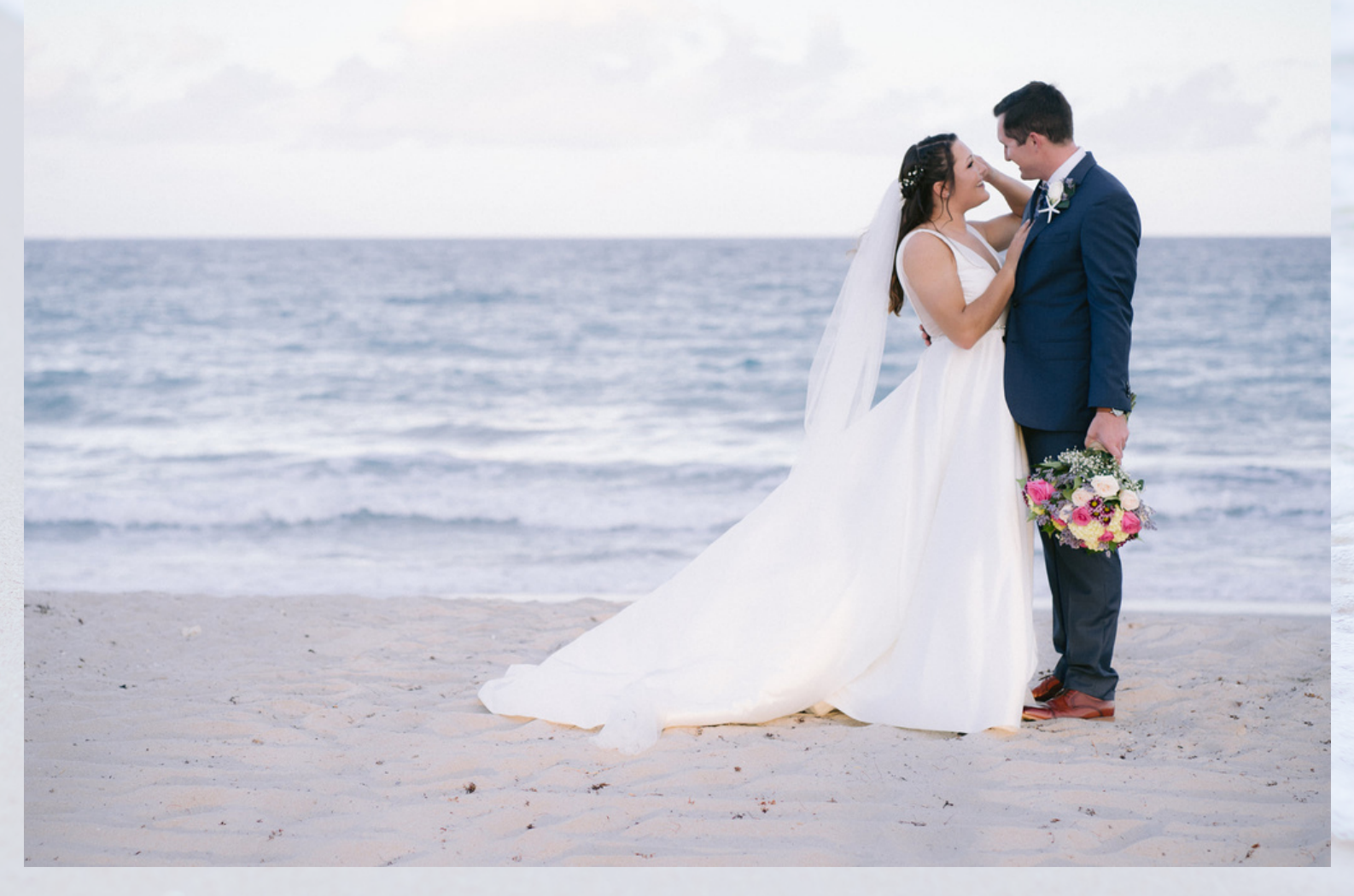
Proudly Serving Broward, palm beach & Miami-dade Counties, Florida