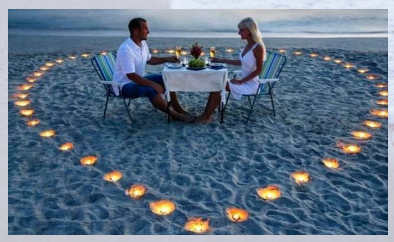
**LIMITED DATES AND TIMES AVAILABLE- CONTACT US TODAY!**

3 Course Dinner Includes: Salad, Appetizers, and Choice of Entrée, Followed by Chocolate covered Strawberries. You May Add Champagne & a Sweetheart-Sized Wedding Cake to End the Night on a Delicious Note! (Ask For a Quote)