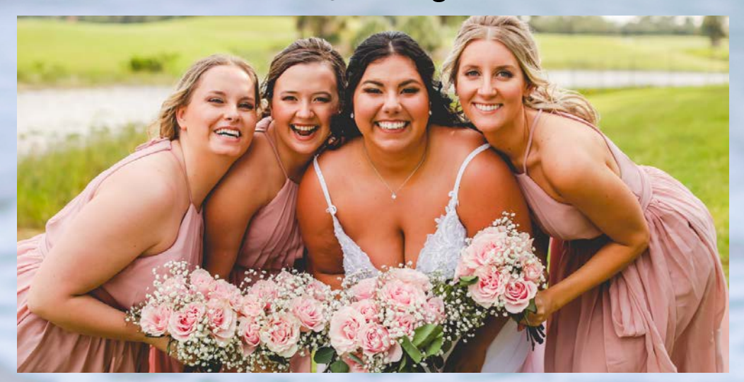
Bridal Bouquet - 5200

MIXED BOUQUET TO MATCH YOUR COLOR PALETTE TIED WITH A SILK RIBBON