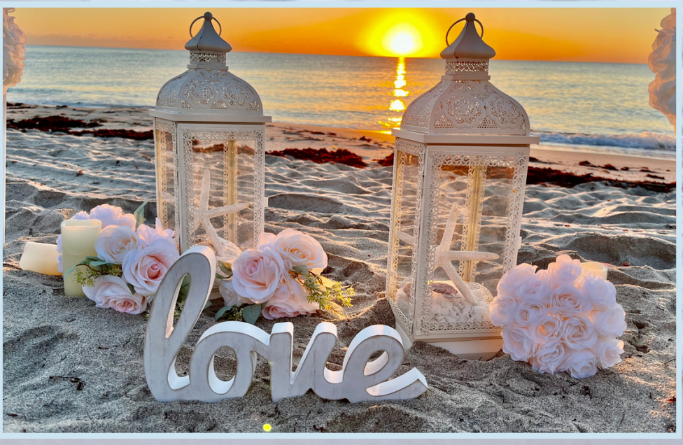
Antique Style Lanterns W/ Seashells & Starfish- 4 for $100