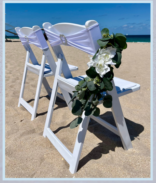
Florals for Chairs on Aisle - $12 Each

(THESE LOOK GREAT ON BOTH SIDES OF YOUR WEDDING ARCH!)