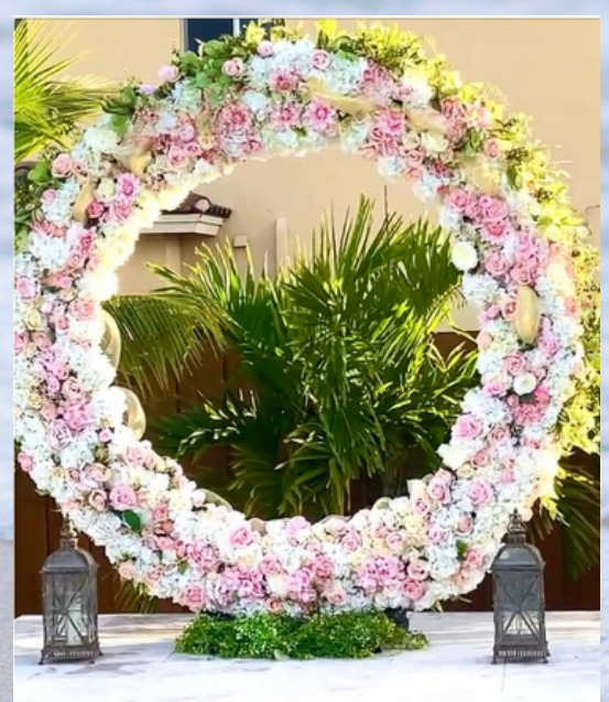
UPGRADE TO CIRCULAR ARCH WITH SILK FLORALS $475 (AVAILABLE AT THIS VENUE ONLY)