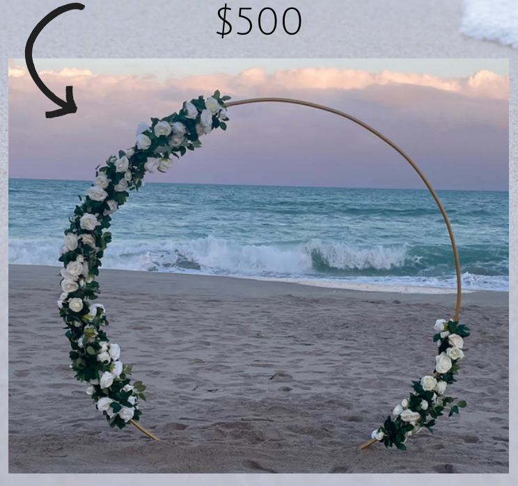
GOLD CIRCULAR ARCH WITH SILK FLORALS $500

WOODEN 2 POST ARCH WITH WHITE DRAPERY & SILK FLORALS $600