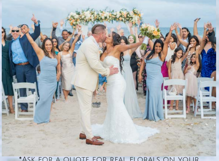
*ASK FOR A QUOTE FOR REAL FLORALS ON YOUR WEDDING ARCH*